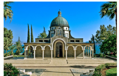
Church of the Beatitudes

Before continuing our journey, we made a brief visit to the Church of the Beatitudes, perched on a nearby hillside not far from Capernaum. It is an elaborate building and carefully tended. If I visited it today, I might wonder how they had identified the location with such accuracy, not least because the 'Sermon on the Mount' is most probably a compilation of various teachings of Jesus. Even then I personally found the building less moving and it was the countryside and an adjacent field of wild flowers (lilies of the field?) which would have been familiar to Jesus and his disciples., that took my attention.