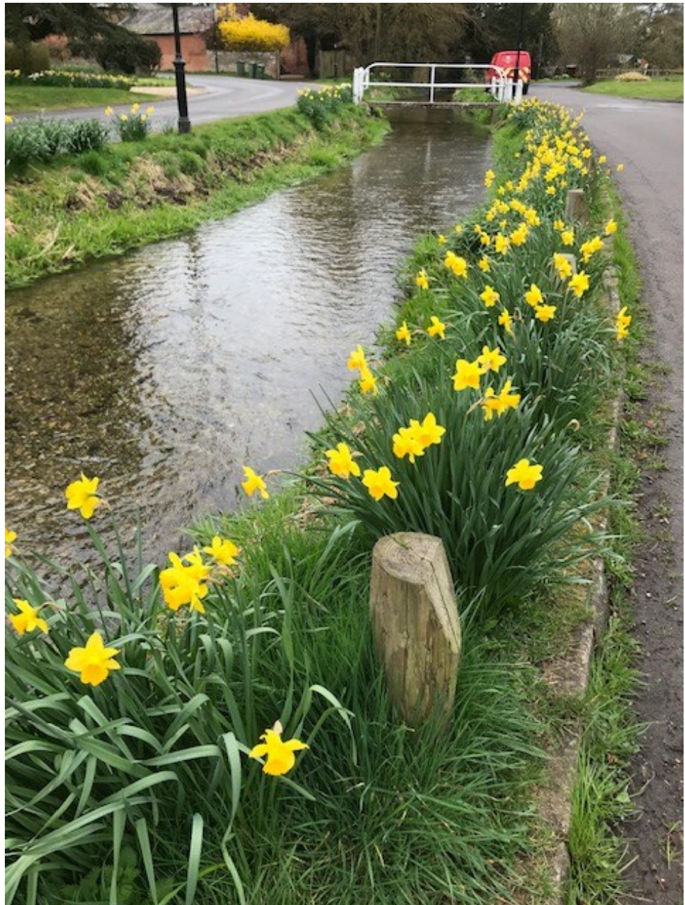
King'S Somborne 2025