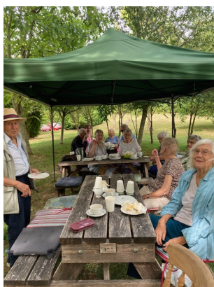
Enjoying a lovely cream tea at the Trout Fishery, Headbourne Worthy.