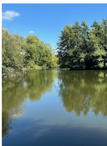
Enjoying all that Lakeside, Eastleigh has to offer!