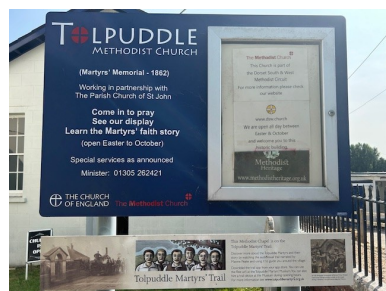
On the Tolpuddle Trail care of the Dorchester Yarriens!