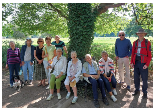
The "Watermelons" Having a respite at the Water Meadows, St Cross